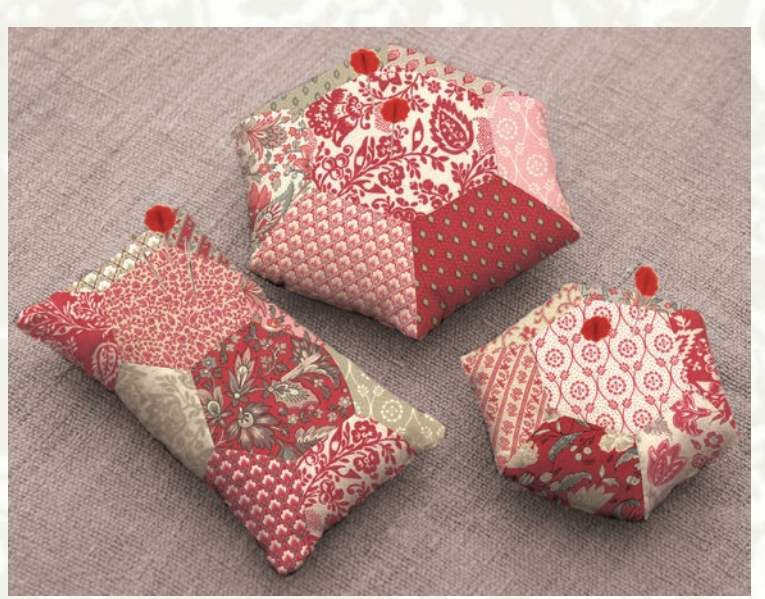
FG CF004 / FG CF004G Pincushions, multiple sizes PP Friendly