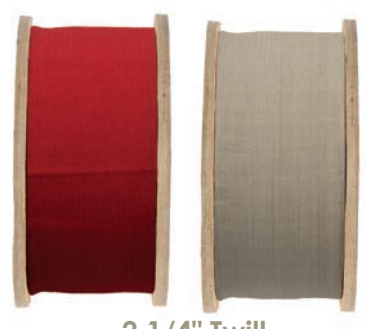
2 1/4" Twill