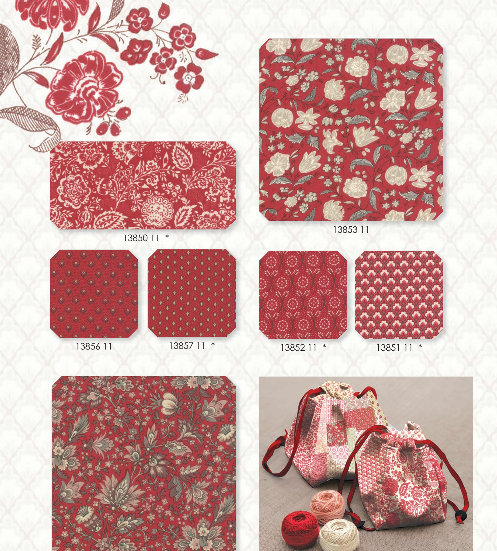
FG CF005 / FG CF005G Tote Bags, multiple sizes PP Friendly