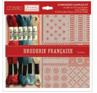
Stock # FG CF006 Mult: 3 Broderie Francaise