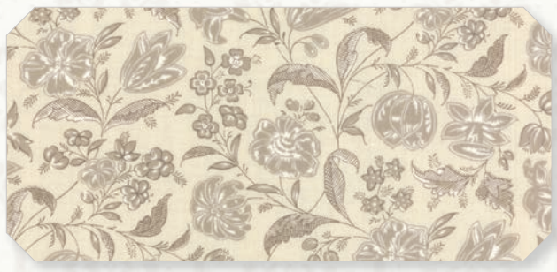
13853 13 *