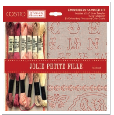
Stock # FG CF008 Mult: 3 Jolie Petite Fille