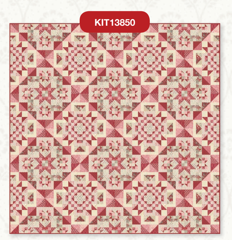
FG CF002 / FG CF002G Estela Size: 72"x72"