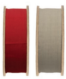
1 1/2" Twill