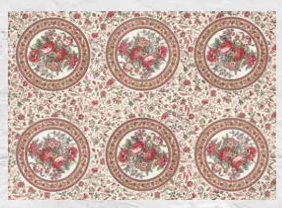
42340 11 * reduced to show full repeat. Medallion measures approx. 8.5"