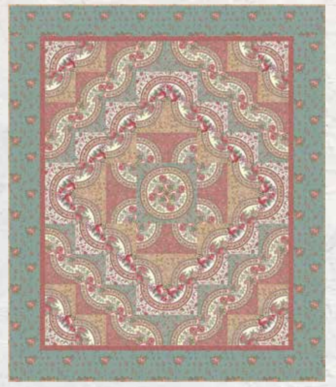
AQD 0271 - Panel Magic 58" x 69"