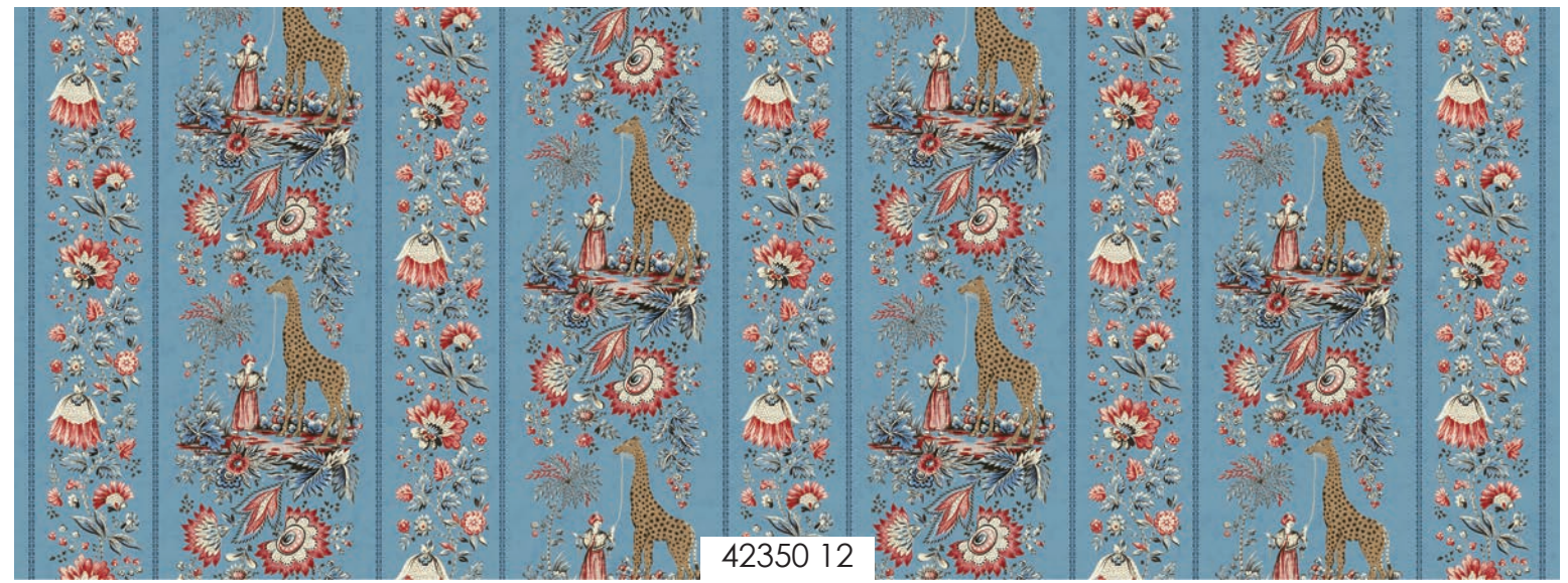
42350 12 reduced to approx. 18% to show Full WOF