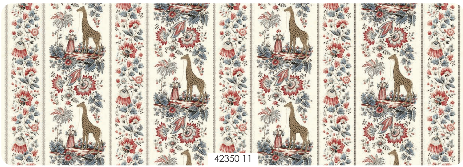
42350 11 reduced to approx. 18% to show Full WOF