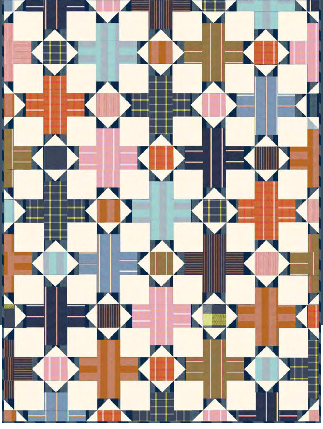
KTQ 137 Kitchen Table Quilting - Hazel