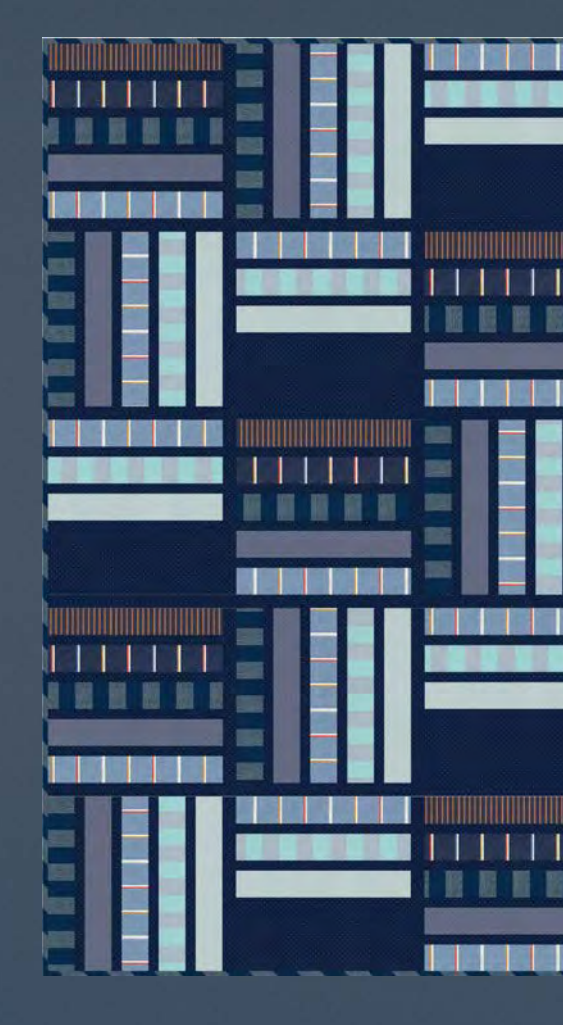
TCJ 123 Then Came June - Blakely