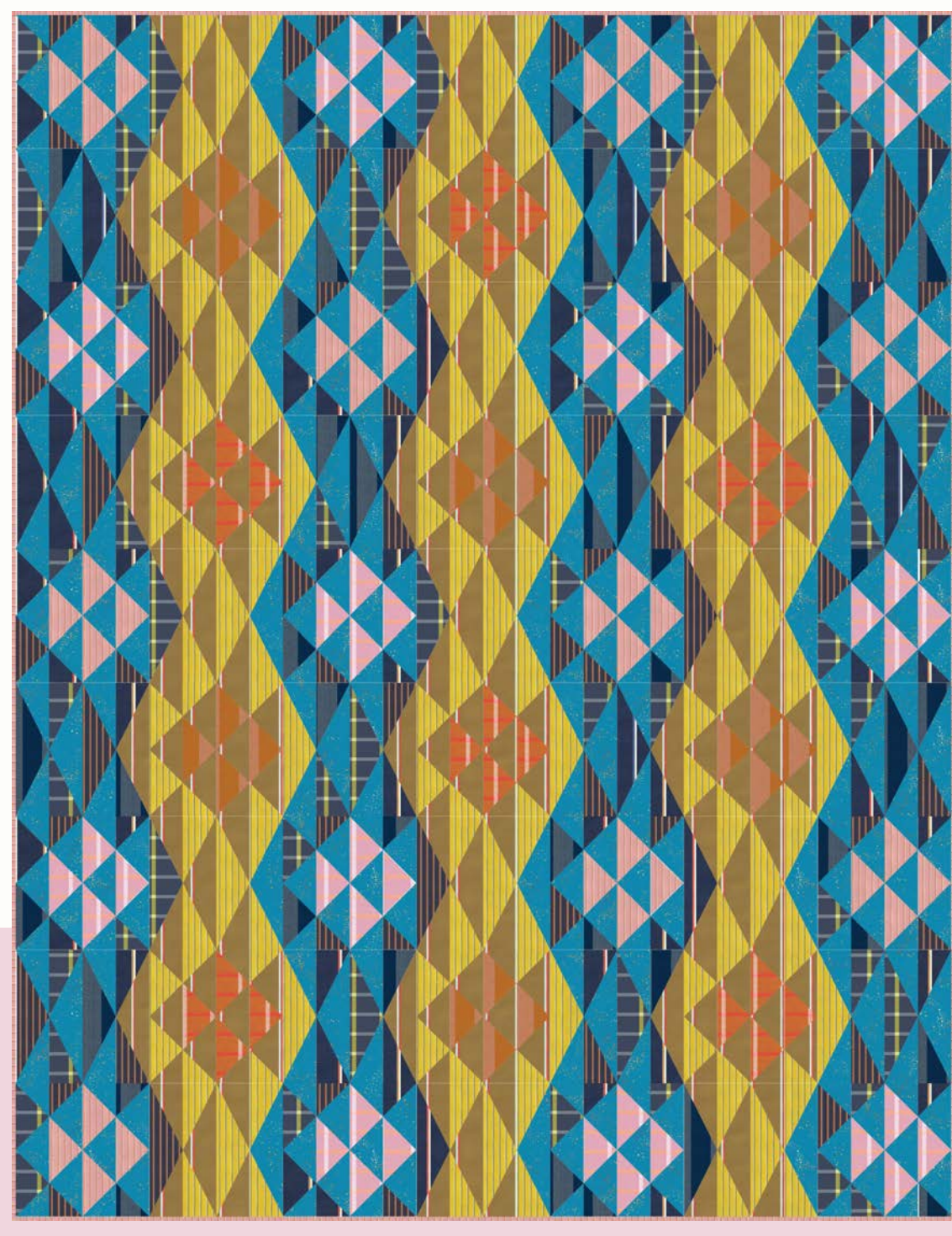
ECQ 2111 Eye Candy Quilts - Protean