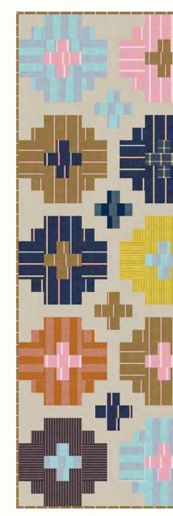
QL 107 Quilty Love - Cross