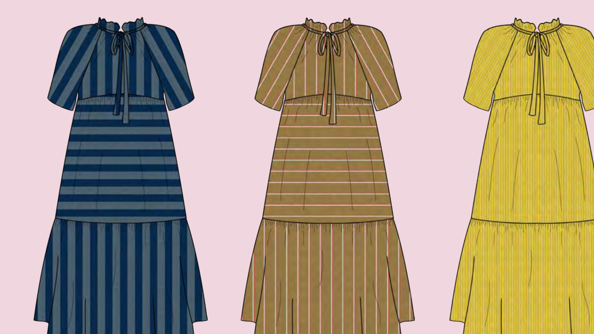
72" x 72"