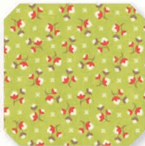
Cotton Blossoms - 20365 16