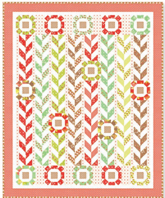
FT 1503 / FT 1503G JELLY BLOOMS MAIN - 48" x 59" - JR Friendly Optional layout available in pattern