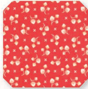
Cotton Blossoms - 20365 12