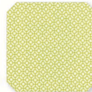
Cobblestones - 20361 16