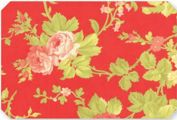
Scarlet Rose - 20360 12