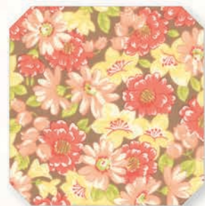
Bouquet - 20362 20