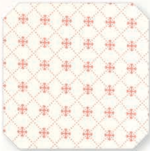
Trellis - 20367 15