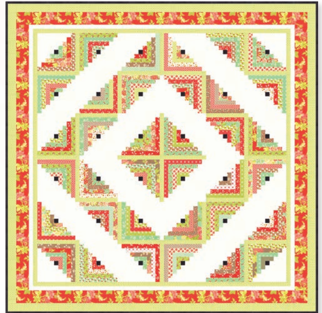
Optional layouts available in pattern

FT 1505 / FT 1505G MY LOG CABINS II C 71" x 71" - HB & PP Friendly