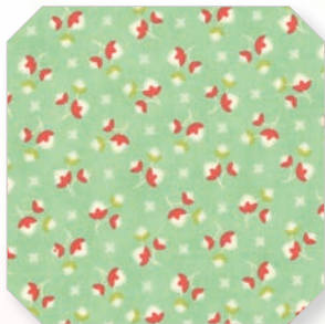
Cotton Blossoms - 20365 18