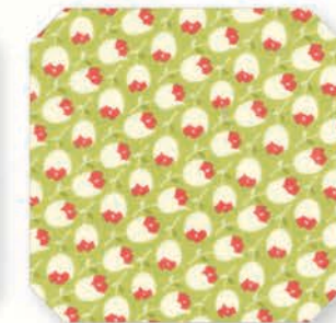
Rosehips - 20364 16