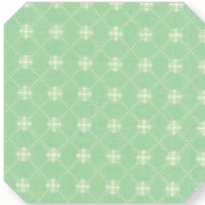
Trellis - 20367 18