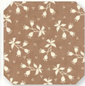
Berries - 20366 20