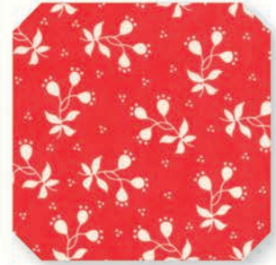
Berries - 20366 12