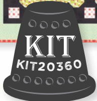
FT 1502 / FT 1502G CROCHET CHARCOAL 66" x 66" - FQ Friendly