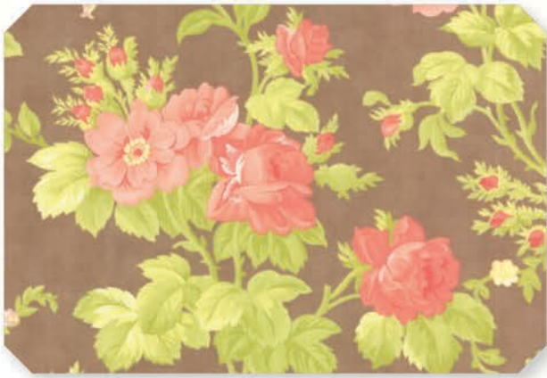
Scarlet Rose - 20360 20