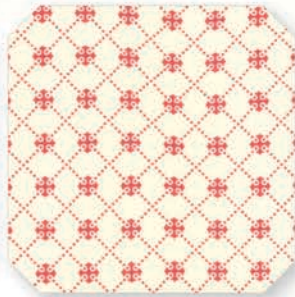
Trellis - 20367 25