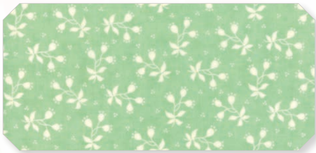
Berries - 20366 18