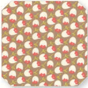
Rosehips - 20364 20