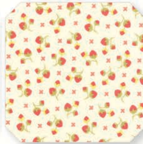
Cotton Blossoms -20365 15