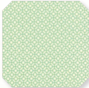
Cobblestones - 20361 18