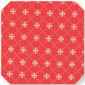
Trellis - 20367 12