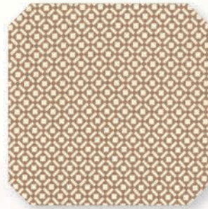
Cobblestones - 20361 20