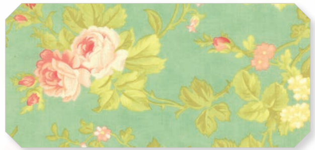
Scarlet Rose - 20360 18