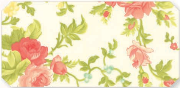
Scarlet Rose - 20360 15