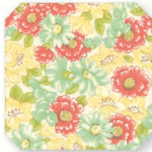
Bouquet - 20362 15