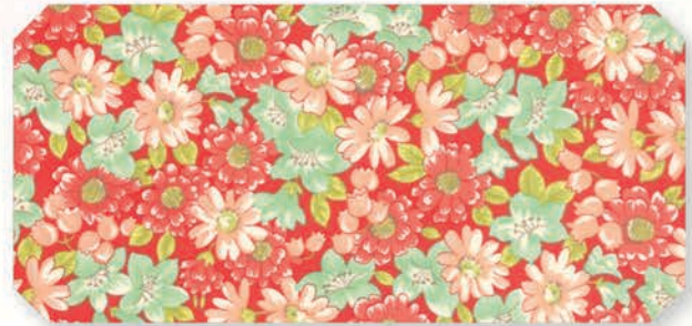
Bouquet - 20362 12