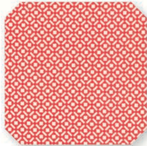
Cobblestones - 20361 12