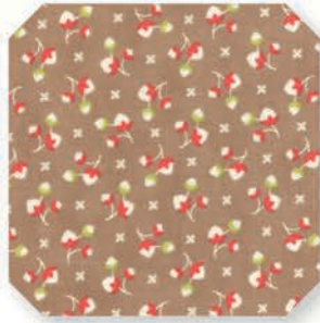
Cotton Blossoms -20365 20