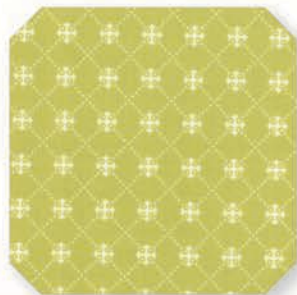
Trellis - 20367 16