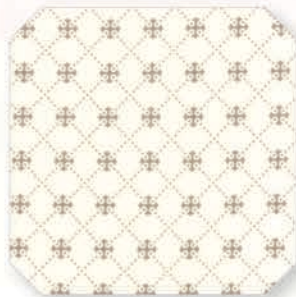
Trellis - 20367 26