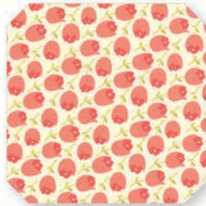
Rosehips - 20364 15